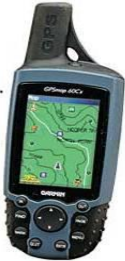
Handheld Global Positioning System (GPS)