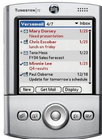
Personal Digital Assistant (PDA)